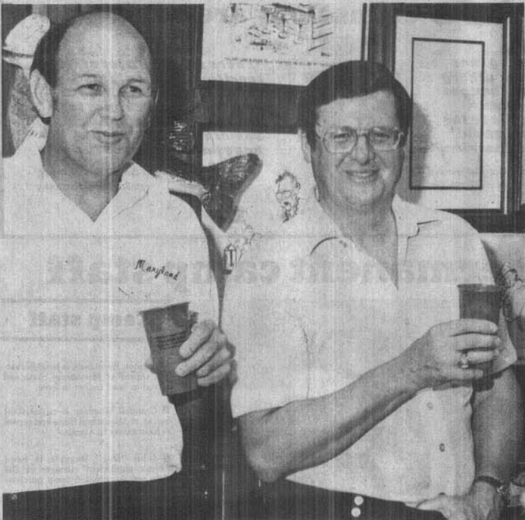
Maryland's Lefty Driesell (left), Kentucky's Joe Hall enjoy B/C hospitality.